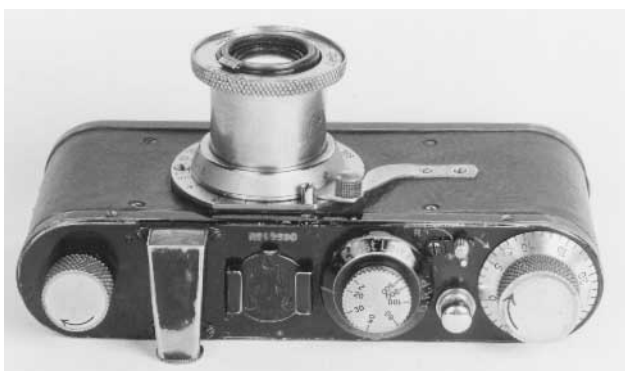
Figure 2: Top view of Leica No. 40330.