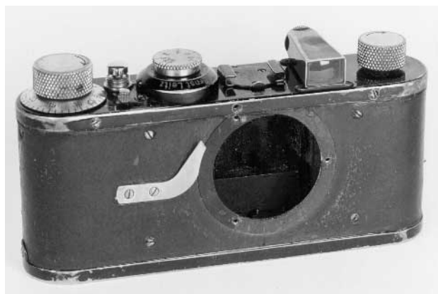
Figure 4: With lens removed, one may observe about the lens opening, from about 12 O’clock to about 7 O’clock, a depression made in the leather by the lens mount. A piece of one of the original fiber shims remains stuck to the leather on the side of the opening nearest the infinity catch.

Not quite so pretty as when it was new, but still with a warm touch of luxury, this is indeed a “Lesser Luxus”.