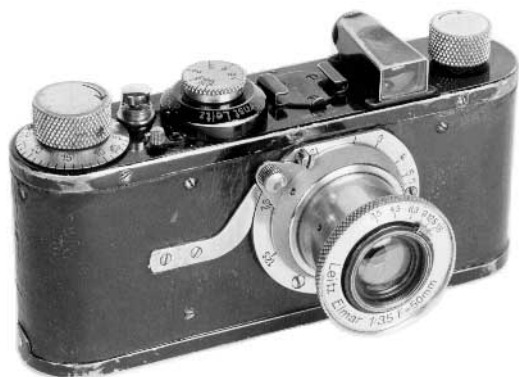
Figure 1: Leica I (A) No. 40330. Note the smooth body covering.